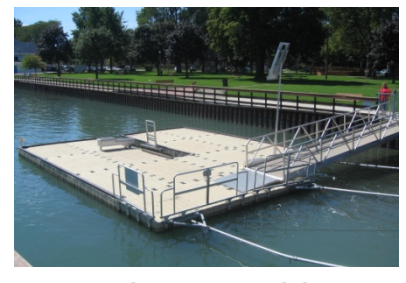
Water Trail ADA Accessibility Guidelines: Whenever possible, local water trail planning initiatives should include ADA-accessible kayak launches. Simple launches like the one pictured above in Wyandotte, Michigan, can be purchased for around $30,000.

Once a paddler is beside the boat, the greatest challenge to using a launch can be getting down into the seat of the boat. Whether it is a highly developed launch or only the bank of a lake, it is difficult to transfer to a moving boat. Making the transfer easier will help paddlers considerably.