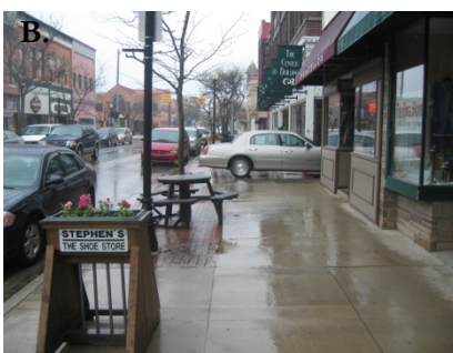
Retail Promotions - Some Thoughts About Signs

Signs advertising local establishments near or adjacent to the trail can help further strengthen the connection between the trail and downtown. However, it is important to consider that too many signs along the trail may negatively impact the trail user's experience. Inconsistent aesthetics and poor placement of signs can be regarded as an eyesore, negatively impacting the natural character of the trail corridor. In general, business signs along the trail should be a much smaller version of the sign that adorns the front façade of the establishment. In addition, the sign should be made of quality materials and provide direction to the trail user. Too many signs, signs with too much information, and signs with direct advertising should be avoided. These considerations can be addressed in the sign and off-premise sign sections of the local zoning ordinance.