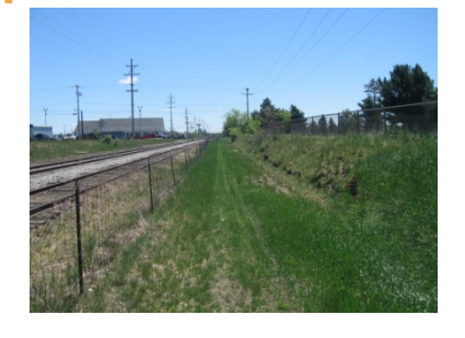
Designated Snowmobile Routes: