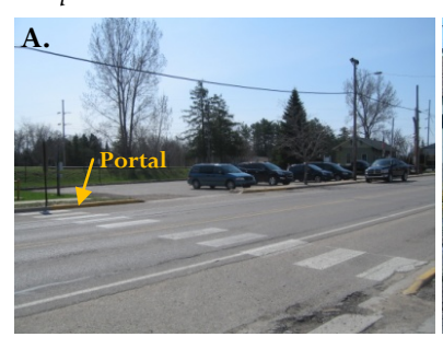
Portal - The Portal should be welcoming, using sidewalks, pathways and wayfinding signage to clearly direct trail users to the central business district. Picture (A) shows a pedestrian crosswalk directly leading from the Trailhead into downtown Indian River, Michigan. Picture (B) shows a well-marked walkway from a trail into downtown Marquette, Michigan, and (C) shows a pathway from the Dequinder Cut into downtown Detroit.

2. Portal. The Portal is the point at which users of the trail exit the Trailhead with the intent of visiting the nearby community. The Portal should be a welcoming point that clearly begins the process of directing the trail user through the community. Trail planners and local officials in Grayling should take steps to be sure the Portal is welcoming, using wayfinding signs, sidewalks and pathways to clearly direct trail users into the central business district. In some instances the Portal may also function as the "Gateway" (see description on page 30) on an internal trail.