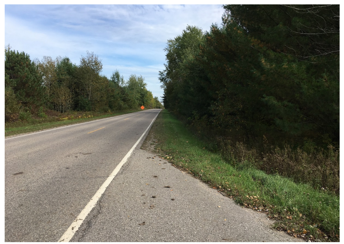
Looking east along Kokosing Road where the path would turn south and traverse through Plainfield Township park land before getting to Wild Cherry Lane and back to M-65.