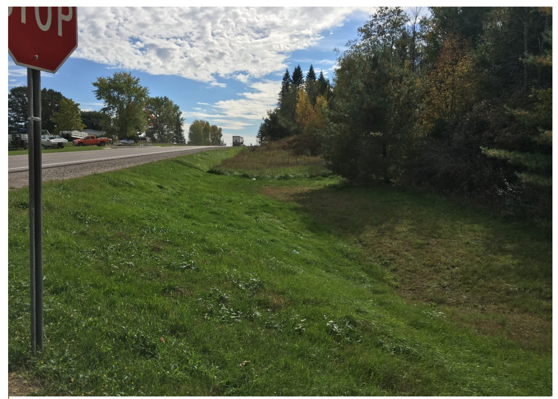
Looking south along M-65 at Wild Cherry Lane, where the path would be located along the west side of the road. There is 200' of total right-of-way along most of M-65.