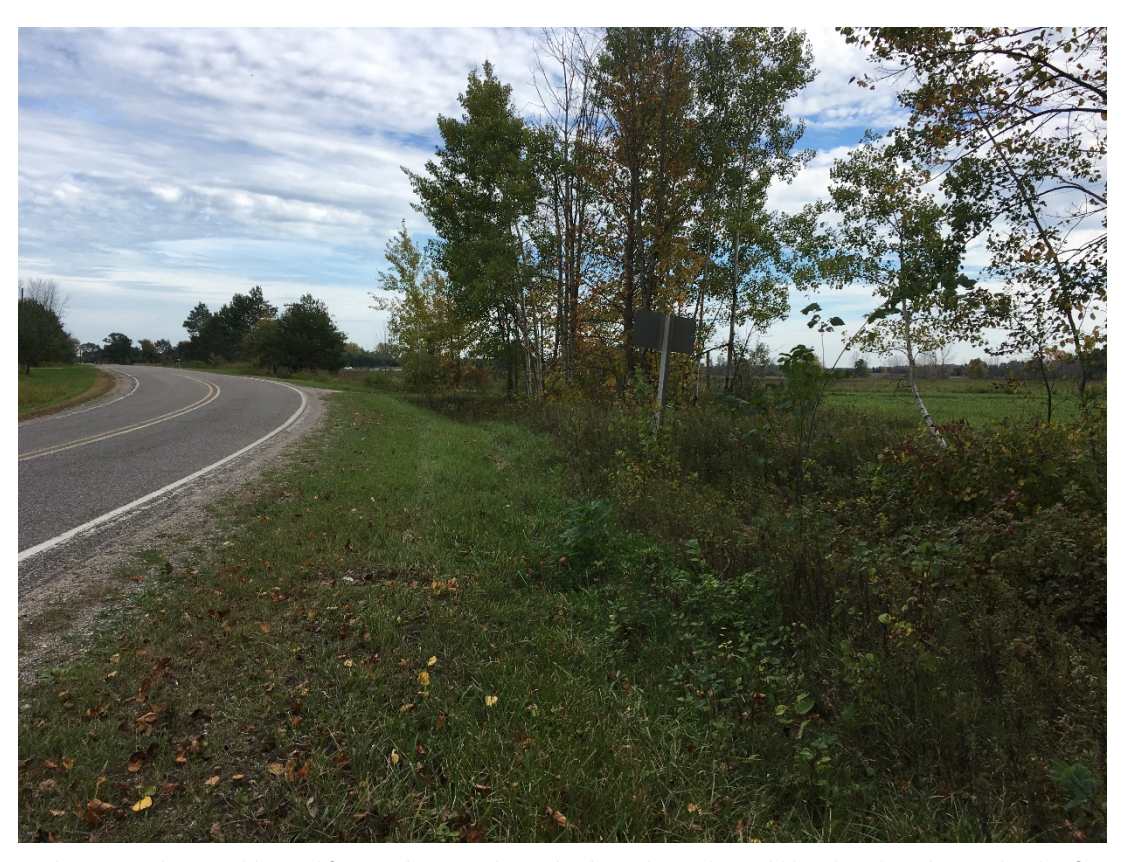
Looking east along Webb Road from Wilson Creek Road, where the path would be placed on the south side of the road.