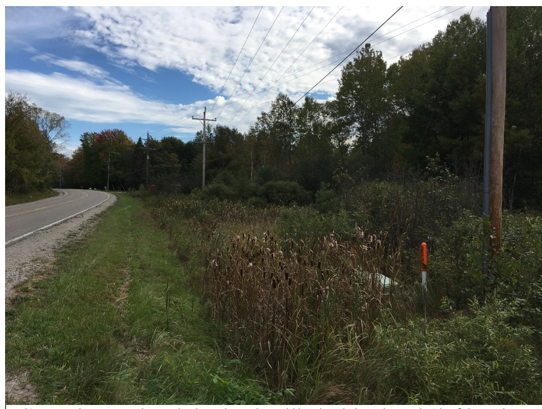
Looking east along Long Lake Road, where the path would be placed along the south side of the road.