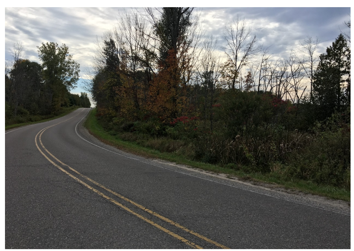
Looking south along Wilson Creek Road from Long Lake Road, where the path would be placed along the west side of the road.