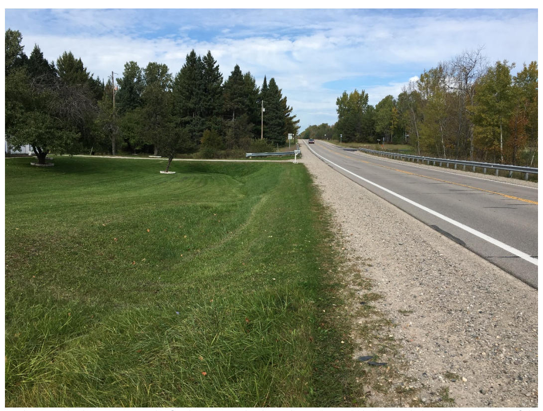
Looking north along M-65 north of Kokosing Road, where the path would be located along the west side of the road. A boardwalk would be utilized to cross the short wetland at this drain crossing.